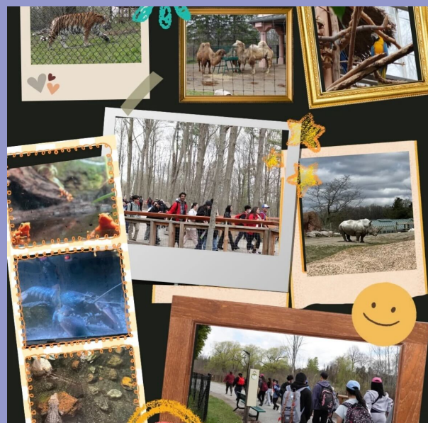
Father Michael McGivney Catholic Academy visiting the Toronto Zoo

York Region's "Under the Sea" Best Buddies Prom was a splash! Huge thanks to all attending schools for celebrating friendship and inclusion!