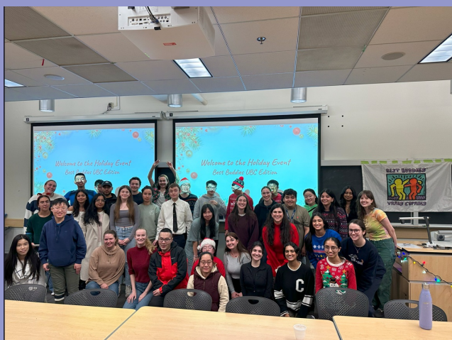
The University of British Columbia chapter hosted a holiday party