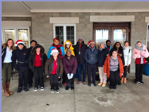
Bishop Reding Catholic Secondary School in Milton, ON sang Christmas carols at a local retirement home