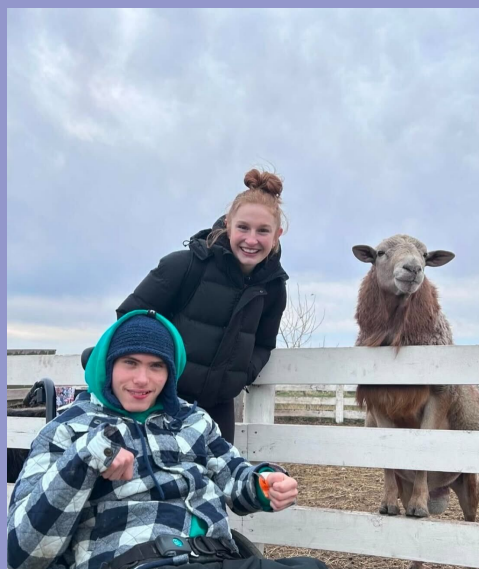
Warman High School in Warman, SK visited a fall farm!