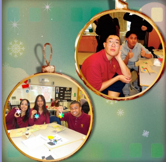
St. Augustine Catholic High School in Markham, ON had a Christmas party