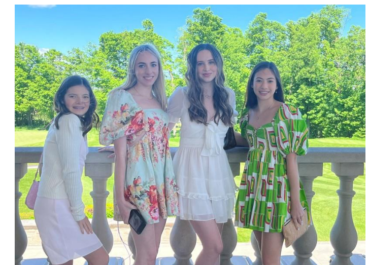
Spirit of Friendship Winners, 2022

Deadline: Stay up to date with our social media for more information!