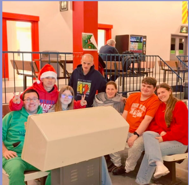
Concordia University went bowling together