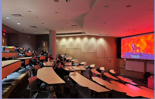
UBC had a movie night and watched The Lion King!