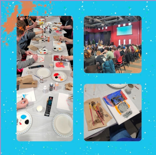
Brock University hosted a painting party