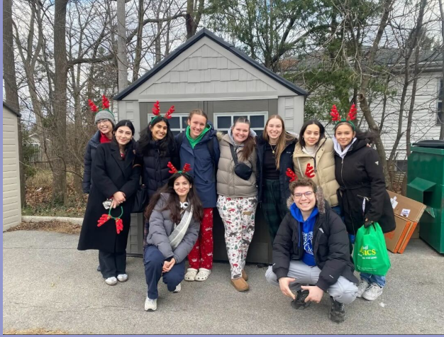
McMaster University had a holiday event!