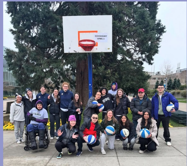
The University of British Columbia's Hooping it Up fundraiser