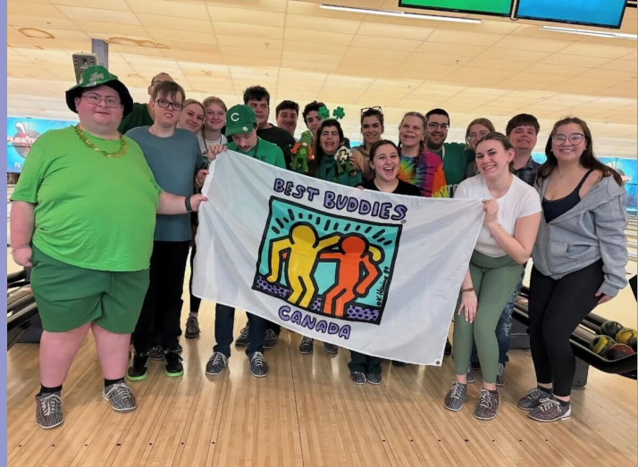
King's University College bowling for St. Patrick's Day