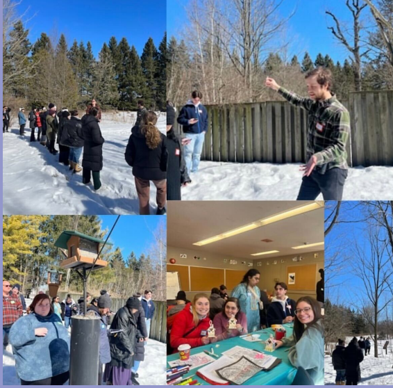
The University of Guelph on a nature walk