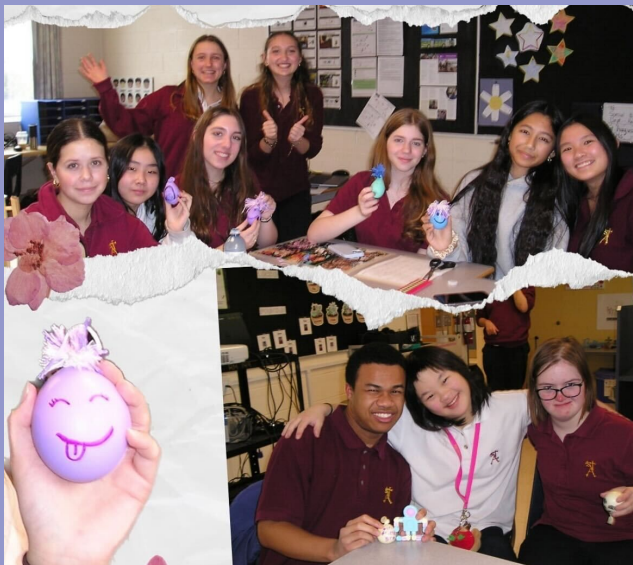
St. Augustine Catholic High School making stress balls